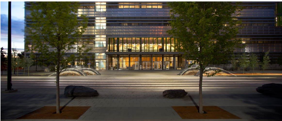
Energy, Environment and Experiential Learning, O2 Planning + Design Inc.

The CSLA is accountable to its membership for the programs it provides, their effectiveness and their costs. The CSLA plans for the future activities with the input of its members.