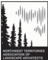
Northwest Territories Association of Landscape Architects (NWTALA)