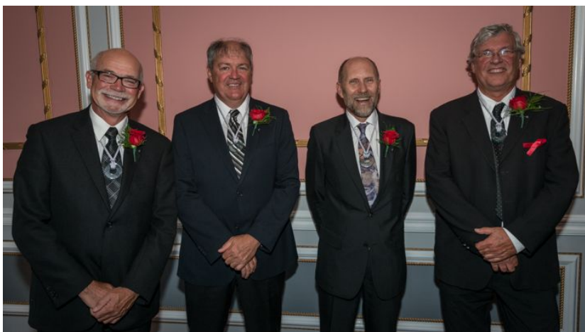
2013 College of Fellows Inductees