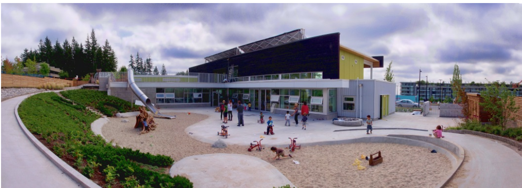
SFU UniverCity Child Care, space2place design, inc.