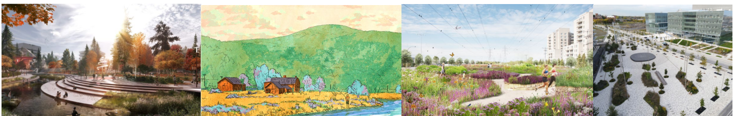
Seve, by Collectif Escargo

The CSLA and its Members share several of the values you promoted in your election platform – recognizing that Canada's landscapes are iconic and vital, understanding the value in the diversity of Canadians, inspiring stewardship of the land and the water, expanding knowledge through science and communication, and demonstrating innovativeness and leadership on issues and challenges of importance to all Canadians. We appreciate your commitment to investing in our communities, investing in green infrastructure, creating better cities, and in reducing the impacts and maximizing the opportunities created by global and local climate change.