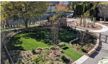
Univ. of Guelph Child Care and Learning Centre