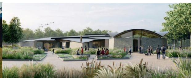
Saugeen First Nations Creator's Garden and Amphitheatre Restoration