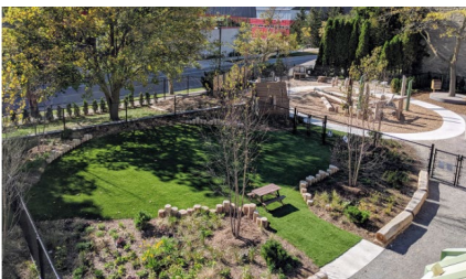
Univ. of Guelph Child Care and Learning Centre

Yellowknife Harbour , where landscape architects created Harbour Plan to create a vision and implementation strategy for this area through consultation events to enable all stakeholders to participate in the Plan's development and review the team's work in progress. The consultation events included workshops, 10 focus group meetings, attendance at a First Nation's drum dance, conversations with First Nation's Elder Council, conversations with First Nation's chiefs, and public presentations. This project was innovative in the methods it used to engage the First Nations in the planning and design process. https://www.csla-aapc.ca/awards-atlas/yellowknife-harbour