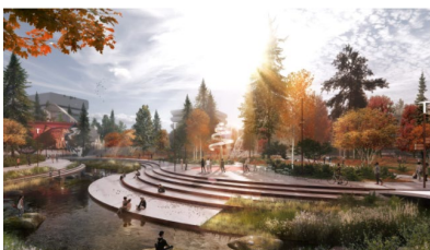
Sève, by Collectif Escargo