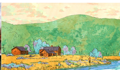
Projet paysage de la MRC Brome-Missisquoi